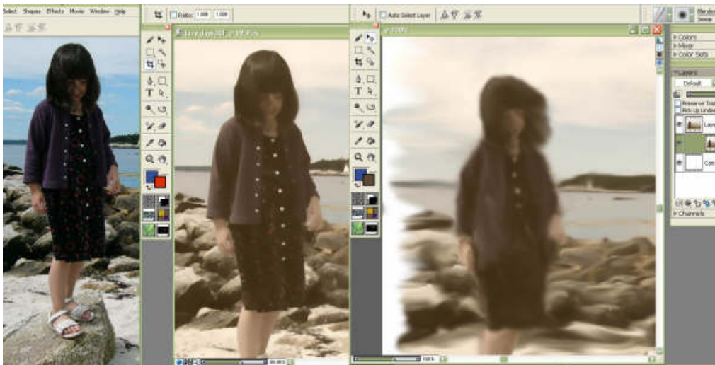
Figure 1 shows a progression from photo, to Auto-Paint (using a sketchbook color scheme and Smart Blur), to the manual use of a blender brush to create a more impressionistic look.

Painter X is the latest version of the software from Corel. It currently retails for $379, $199 for an upgrade, or $119 for the educational edition. Further information on the product, and a free trial version are available at http://www.corel.ca .